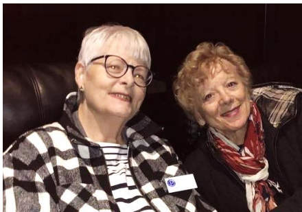
Watching the movie "The Holdovers" and dinner afterward