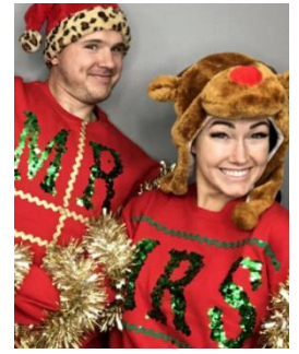
Country Living/ Nov. 2022

Should you choose to participate, come to our December 13 meeting sporting an ugly sweater, which you have decorated yourself (i.e. not a store-bought ugly sweater – that’s too easy) or some Christmas Headgear. There will be a prize for each category bestowed by our own merry PROBUS elf.