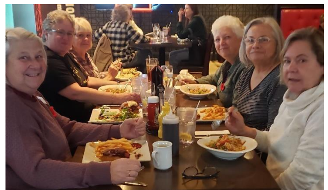
Nov. 9 at Anchor Point Fusion in Courtice