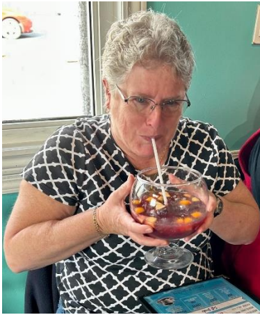
Mexico Lindo Restaurant, Nov. 7