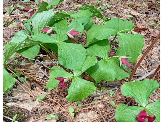
Newcastle Waterfront Trail; April 24