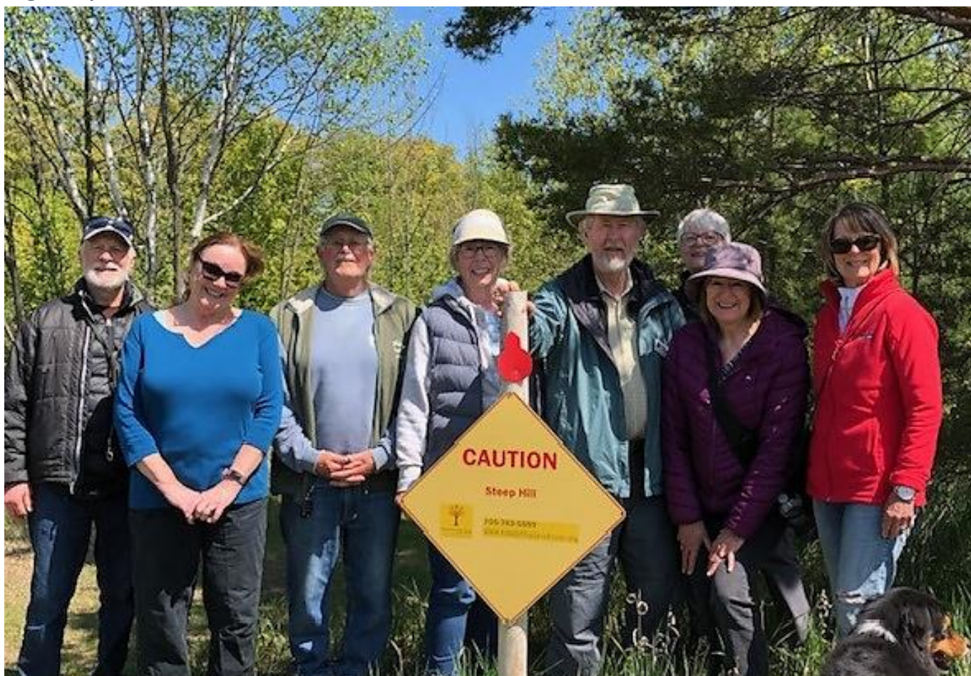
Ballyduff Trails, Pontypool