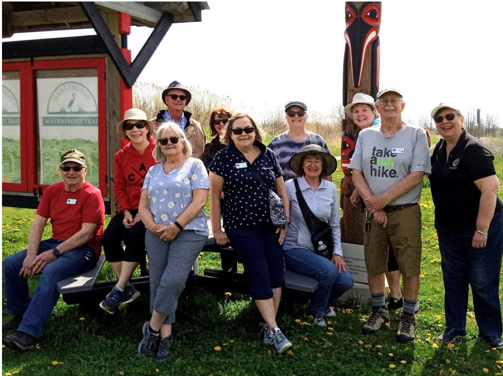
Darlington Trail; photo by Lynn Hooper