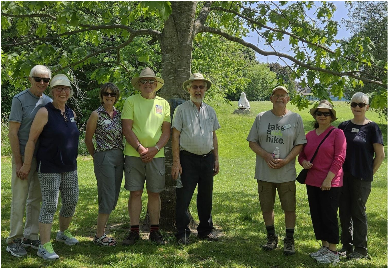
Harmony Creek Trail