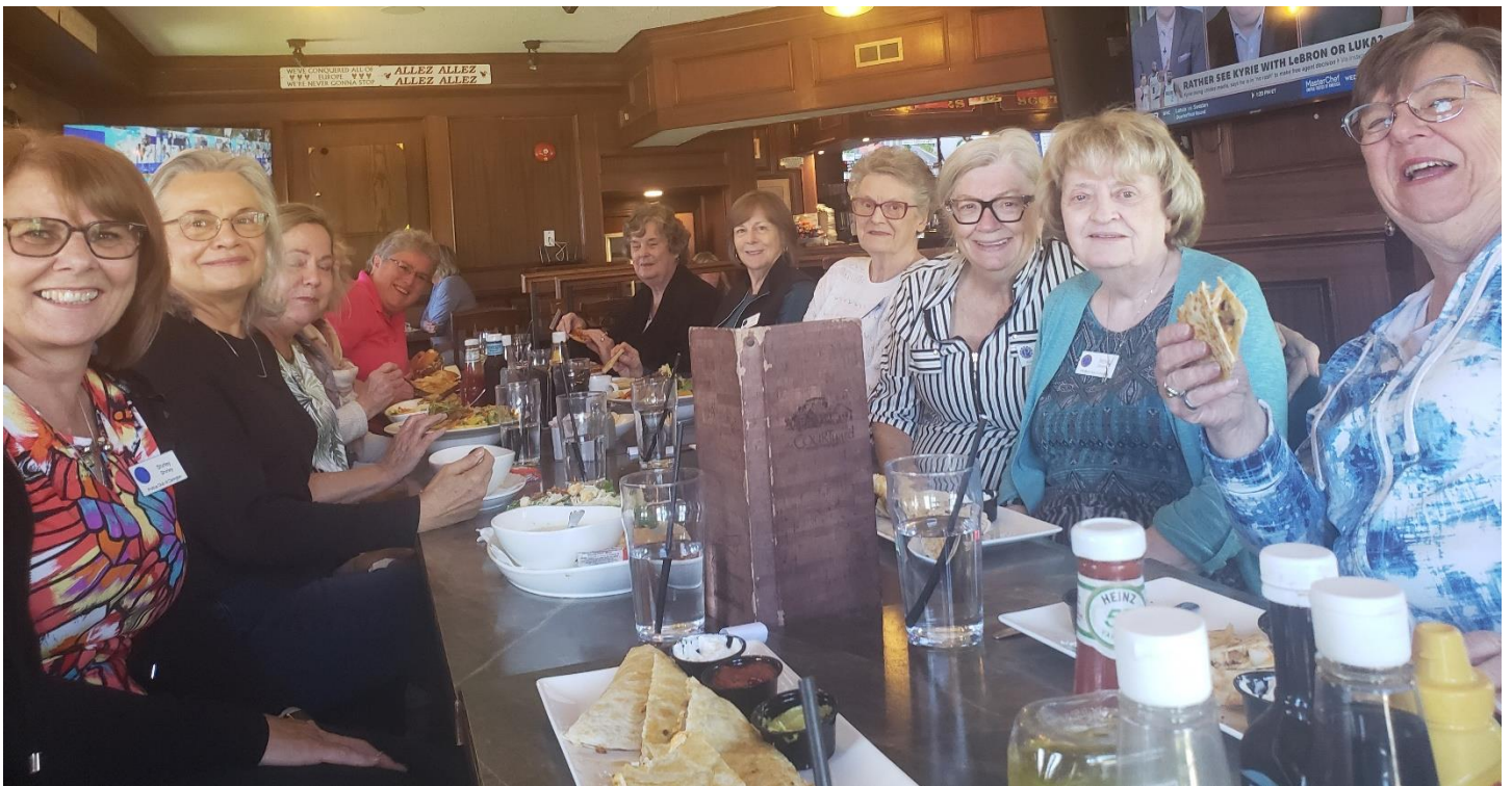
The Courtyard in Courtice