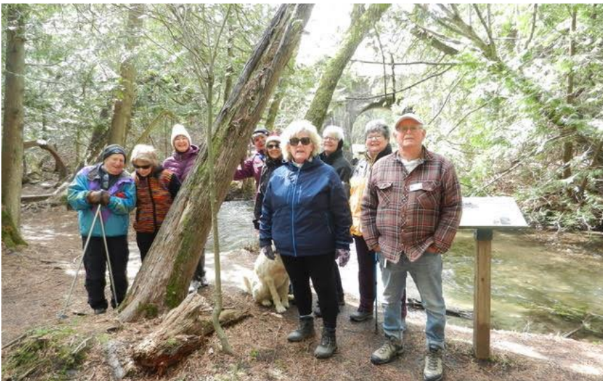
Ten happy hikers and one dog enjoying our first hike of the season in the Orono Crown Lands.