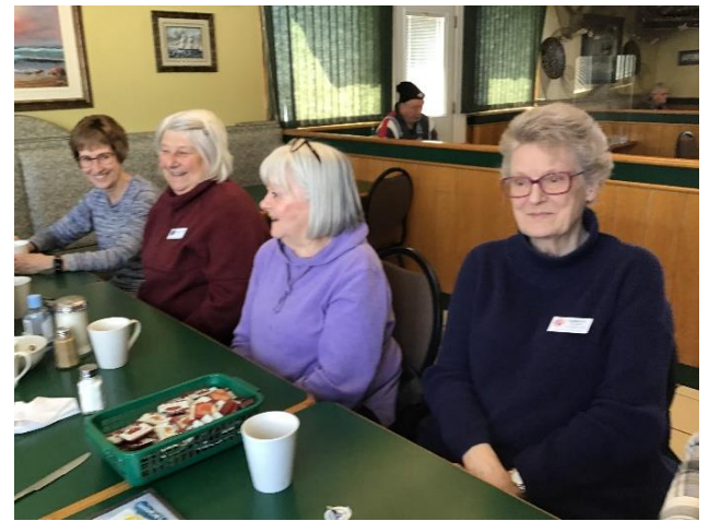
Breakfast Club meet up March 30 th at The Fisherman on Hwy 115.