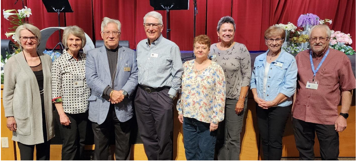
Outgoing Management Team...