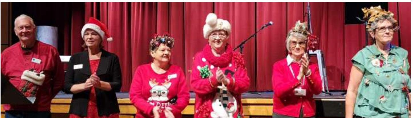
All December Miscellany photos by our much-appreciated homegrown photographer, Pleun Dorsman