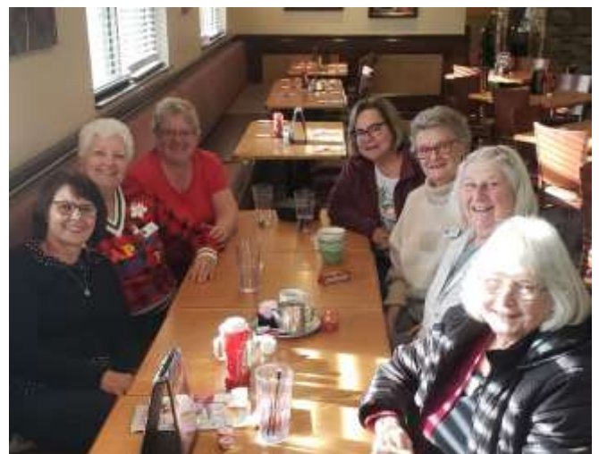
Bowmanville Swiss Chalet; Submitted by Shirley Shirley